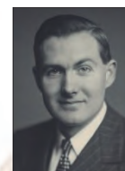
Prime Minister James Callaghan MP

1953: Voluntary member contributions begin and future Prime Minister James Callaghan MP is made an advisor to the Federation