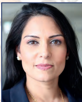
Rt. Hon. Priti Patel Home Secretary

The Federation plays a key role in this. Whether it is engaging with government, supporting families, or helping officers who have been assaulted, the organisation continues to work tirelessly to represent the interests of rank and file officers. I would like to thank all of those who have been a part of the Police Federation over the years, who have made a tremendous contribution to policing in England and Wales. You have been there for our police, who are there for us all. I look forward to seeing what more you can achieve in the years to come.”