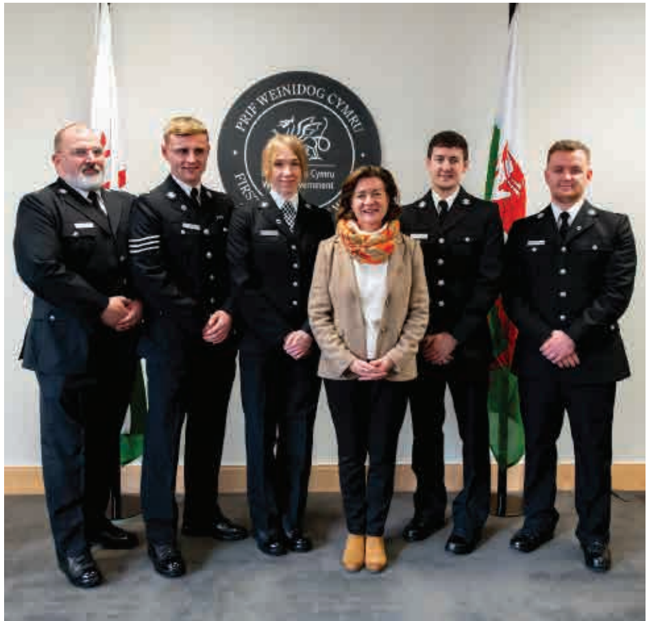
First Minister Eluned Morgan with our brave officers.

Police officers don't get to define the nature of the incidents they are called to deal with and these officers put themselves into danger and potential harm in order to protect somebody in distress. As a wider policing family, we are very proud of what these officers did and the bravery with which they carried out their duties.