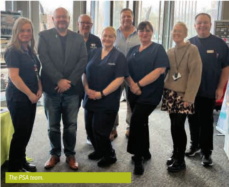
The PSA team.

North Wales Police Federation has once again supported its members and police staff, current and retired, Special Constables and volunteers by joining the team for workforce PSA testing.