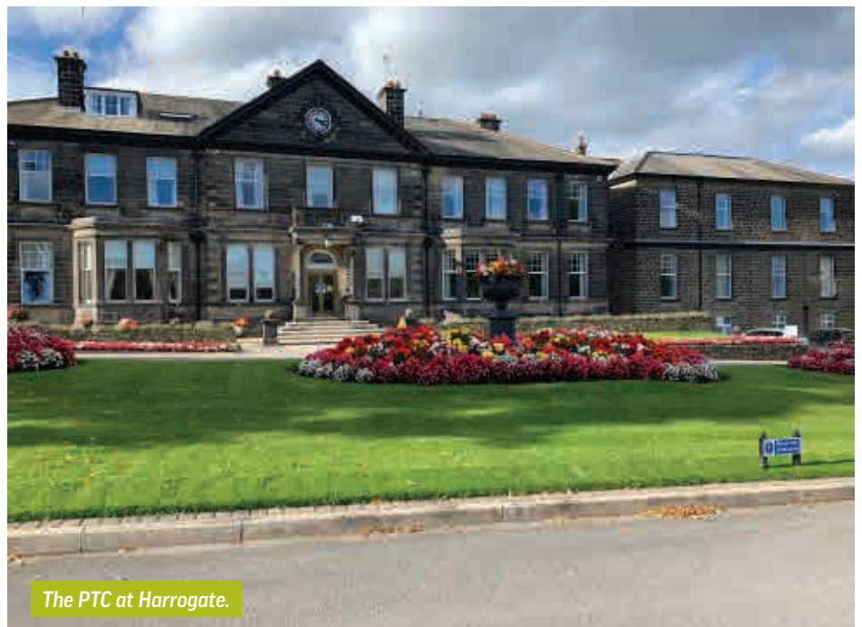
The PTC at Harrogate.