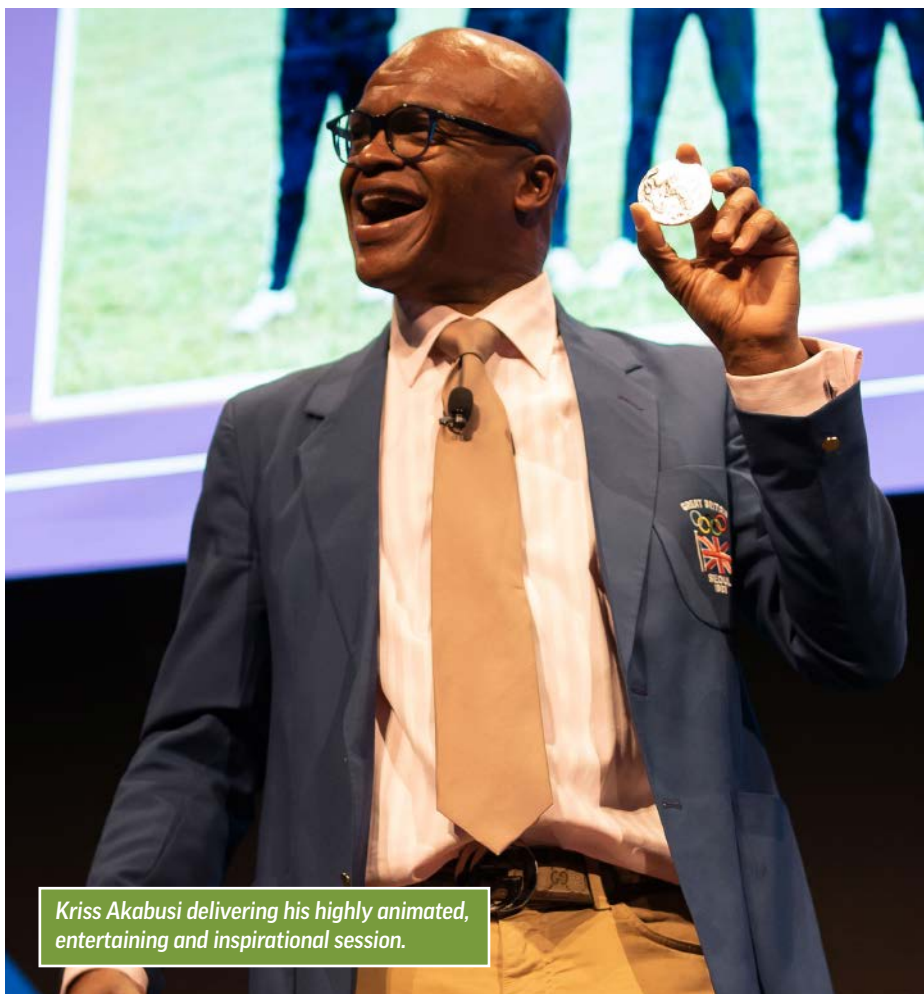
Kriss Akabusi delivering his highly animated, entertaining and inspirational session.