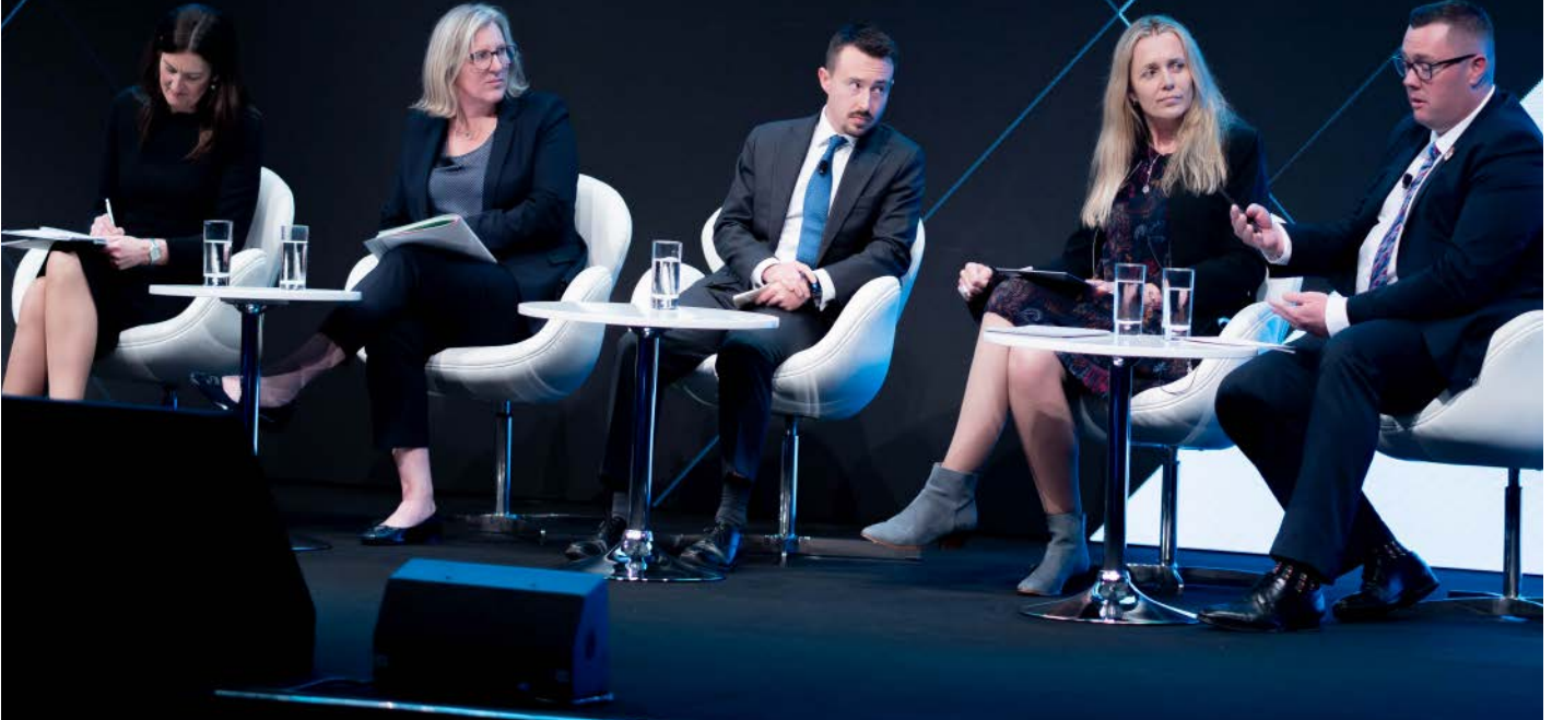
The uplift session panellists.