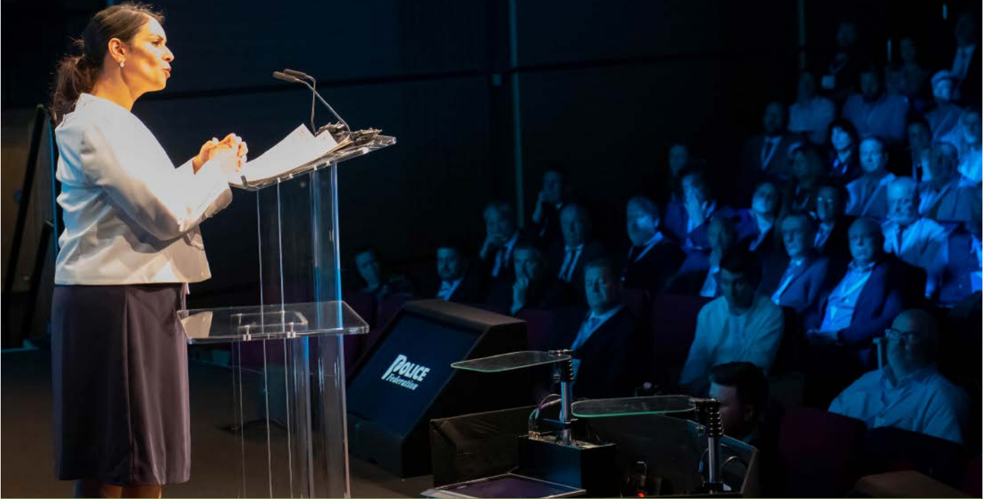
Priti Patel giving her keynote speech to conference.